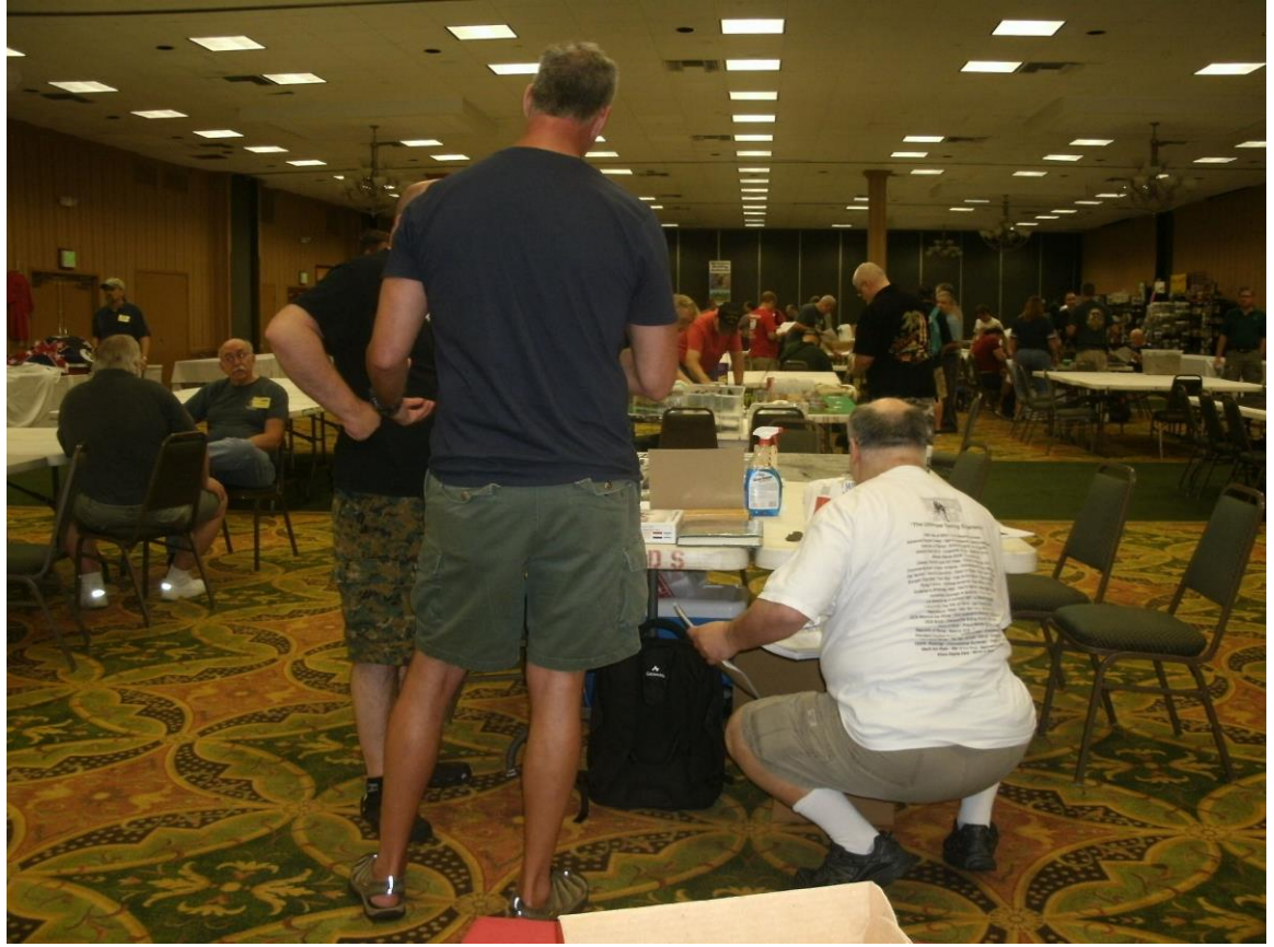
Meanwhile on Thursday-before the convention Gamers arrive