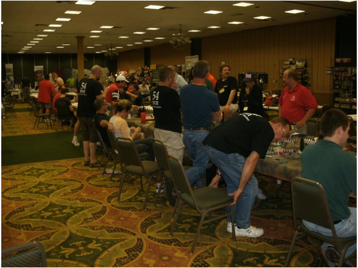
And ATKM'S massive 54mm American Revolutionary Epic