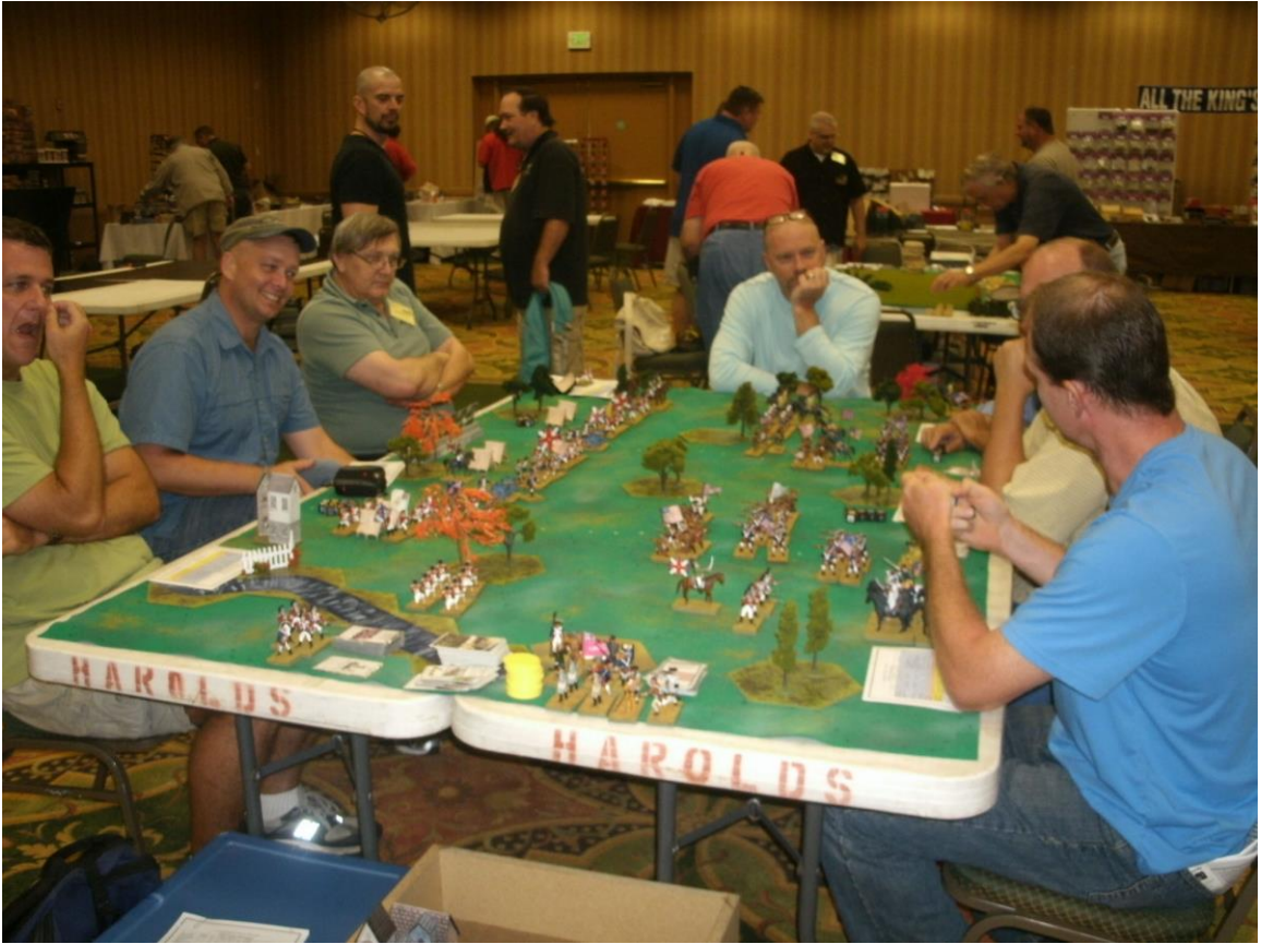
Eutaw Springs brings out ATKM's 54mm Figures and BATTLE CRY rules