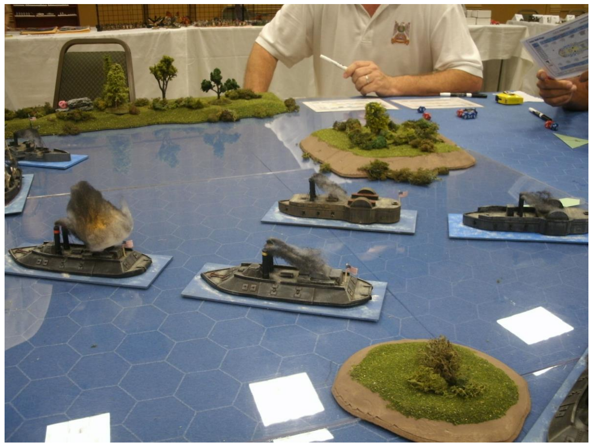
Bob Moon returned to Arkansas Post with a reinforced Confederate Navy