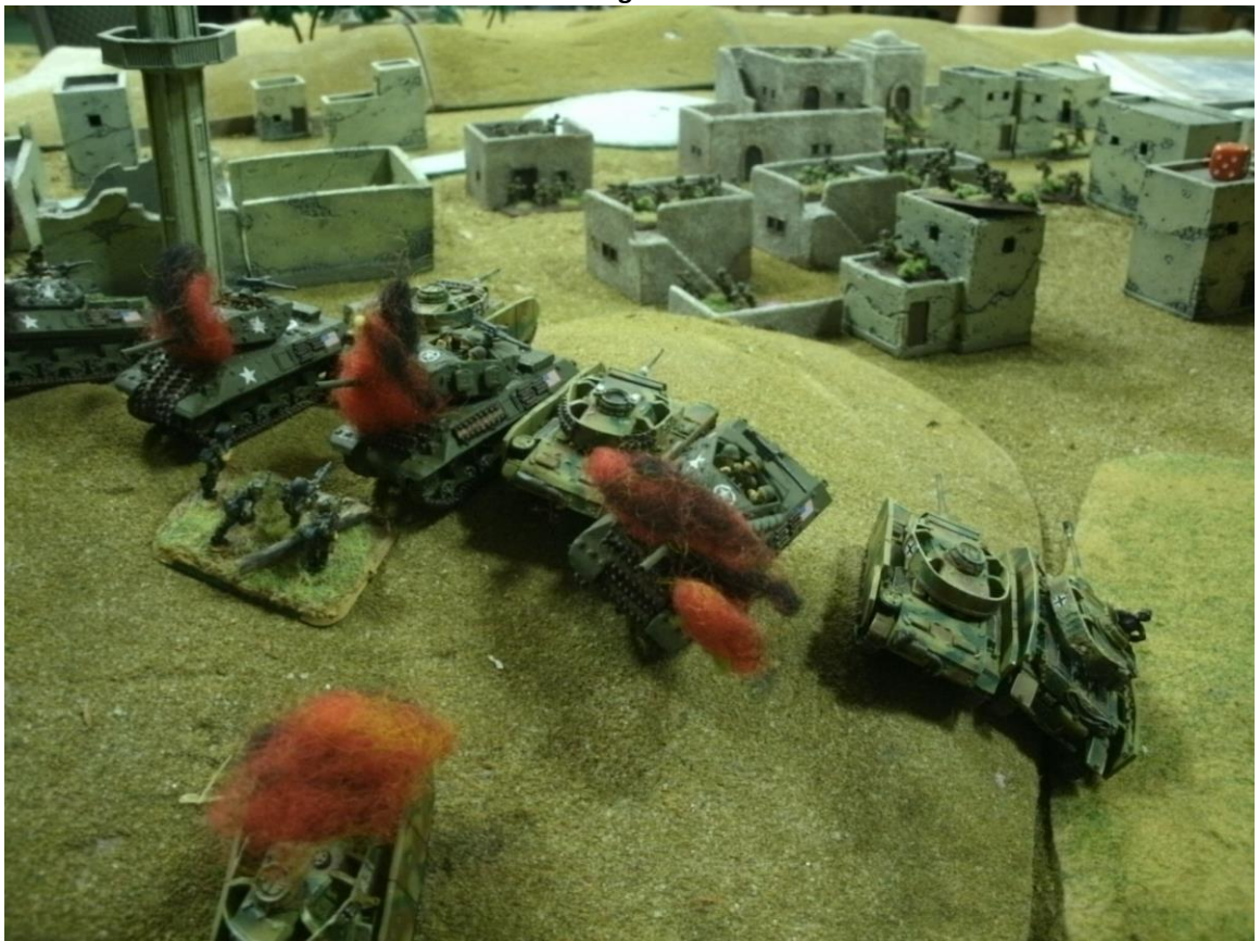
Meanwhile the tournaments heat up