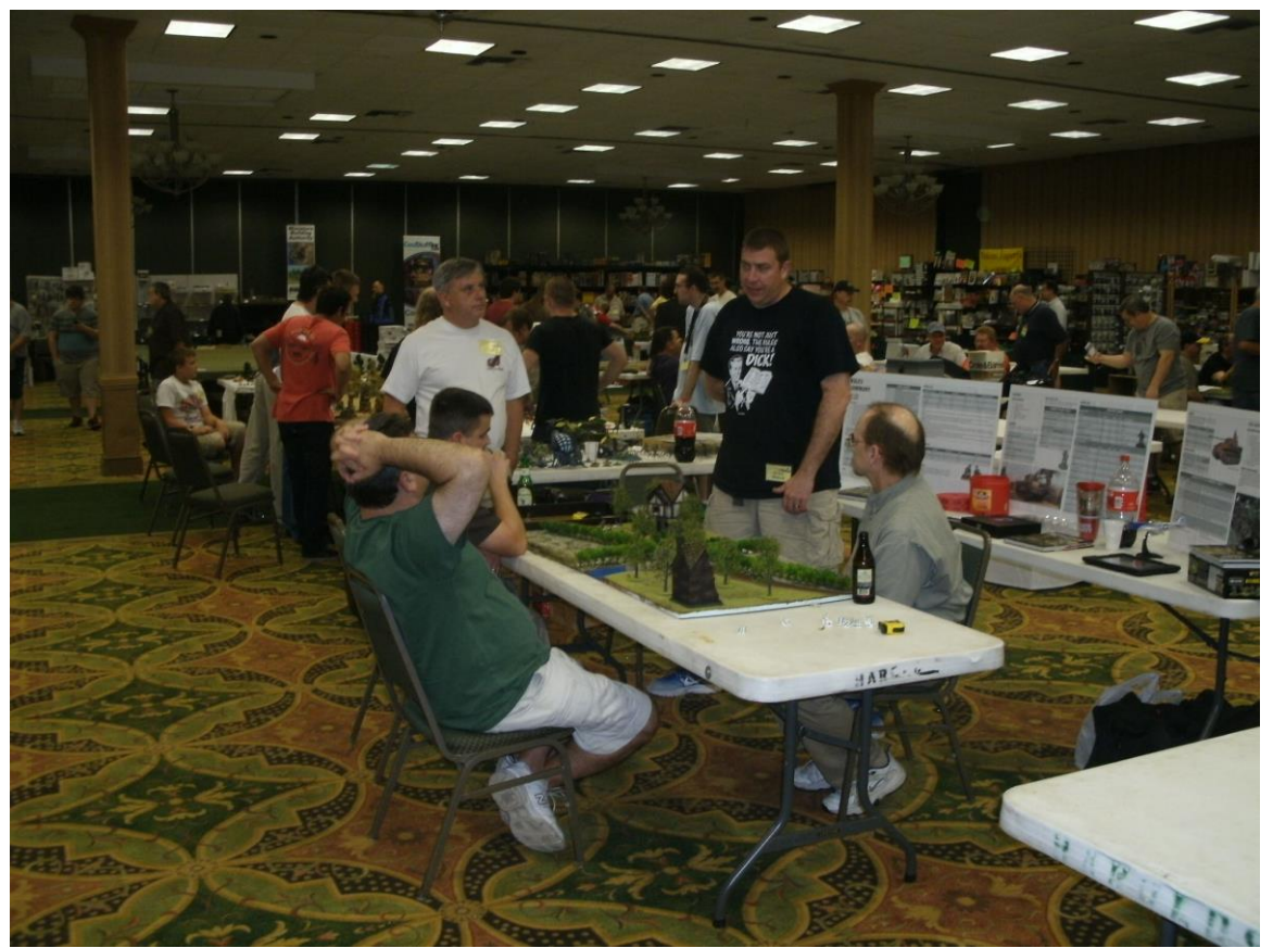
For most of the convention there were small demos of Bolt Action WWII Front And Center