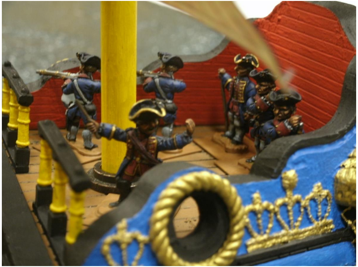
View from The Quarterdeck