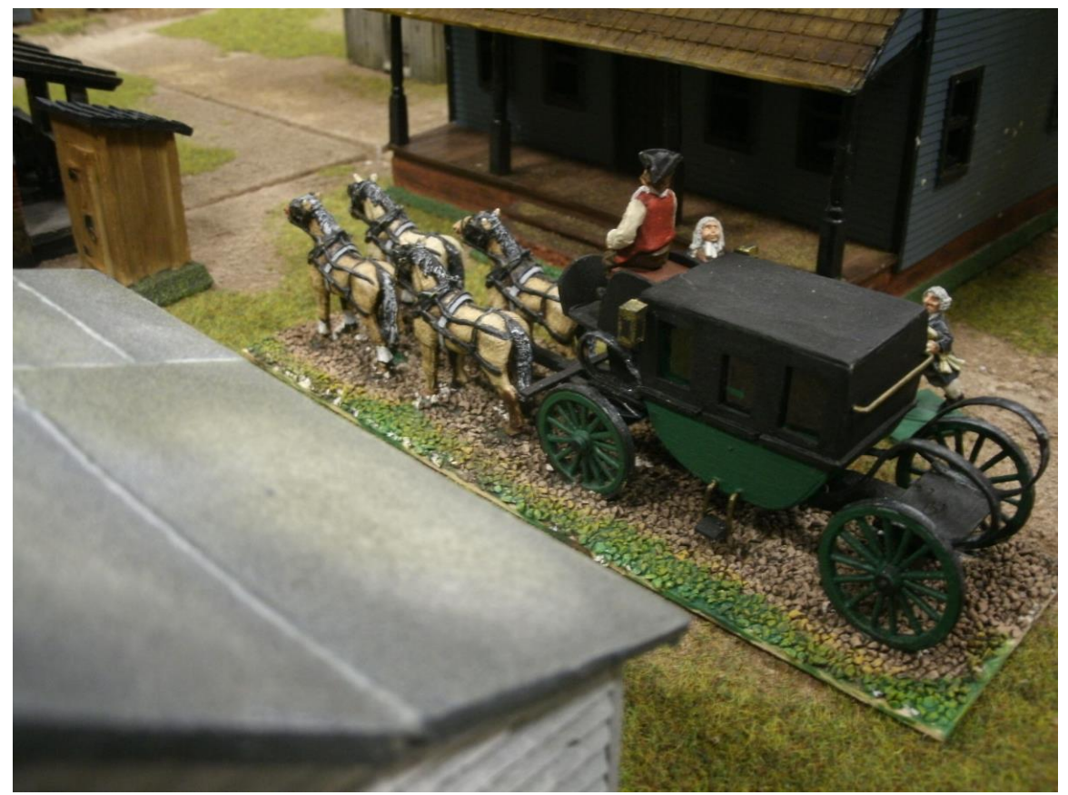
Business As usual In downtown Yorktown