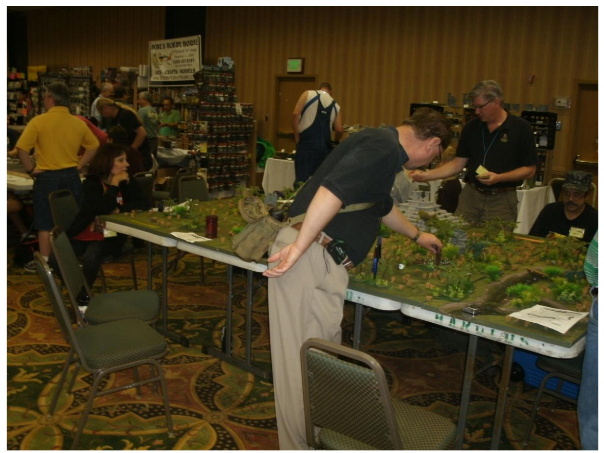
A Darkest Africa Epic