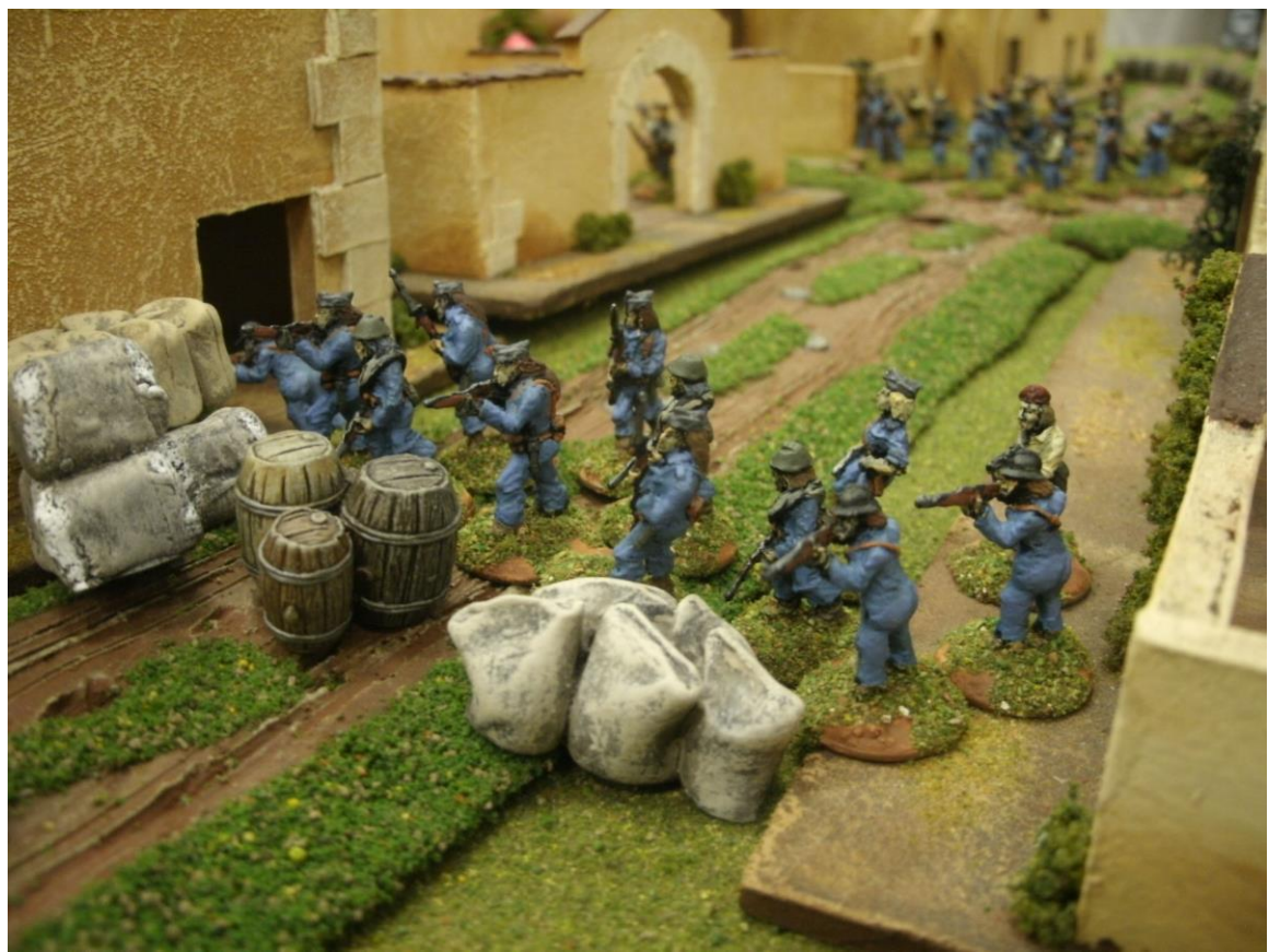
I saw my first SCW BOLT ACTION-Rosa Luxemburgos in action