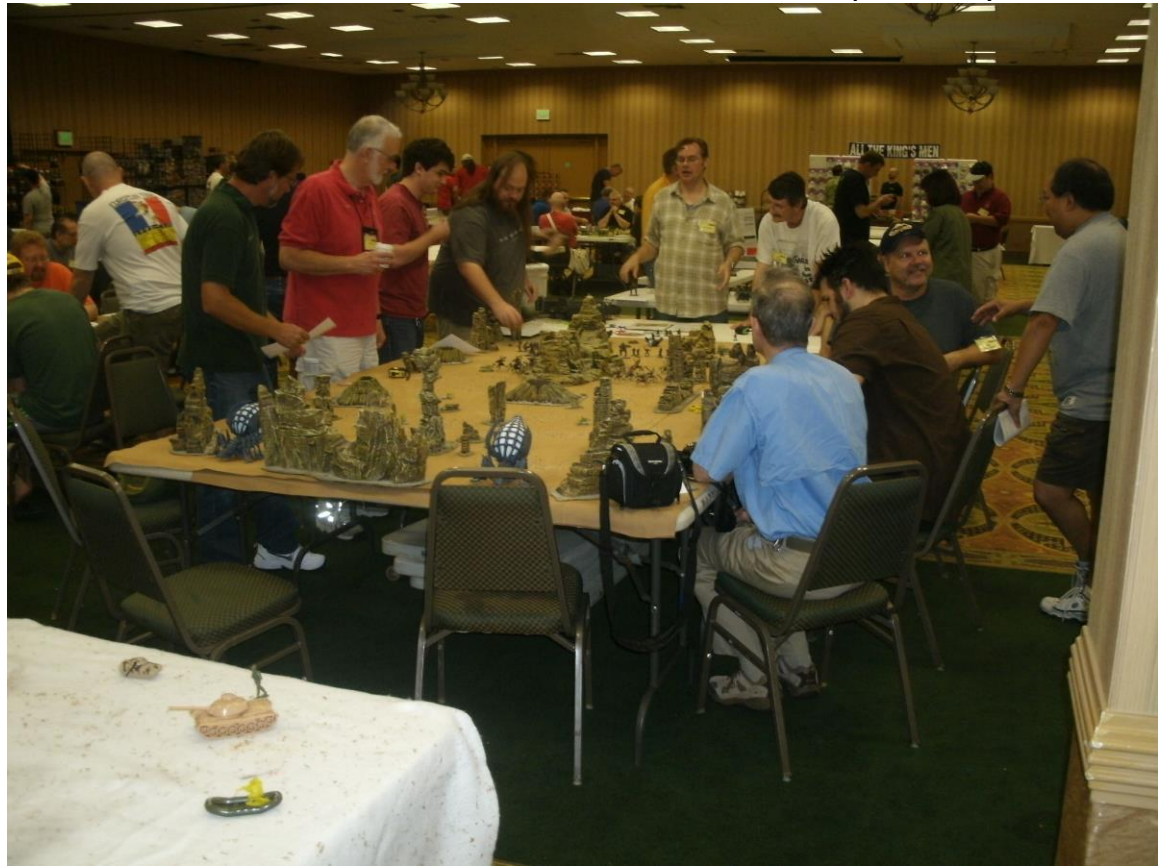
Something to do with Starship Troopers I think