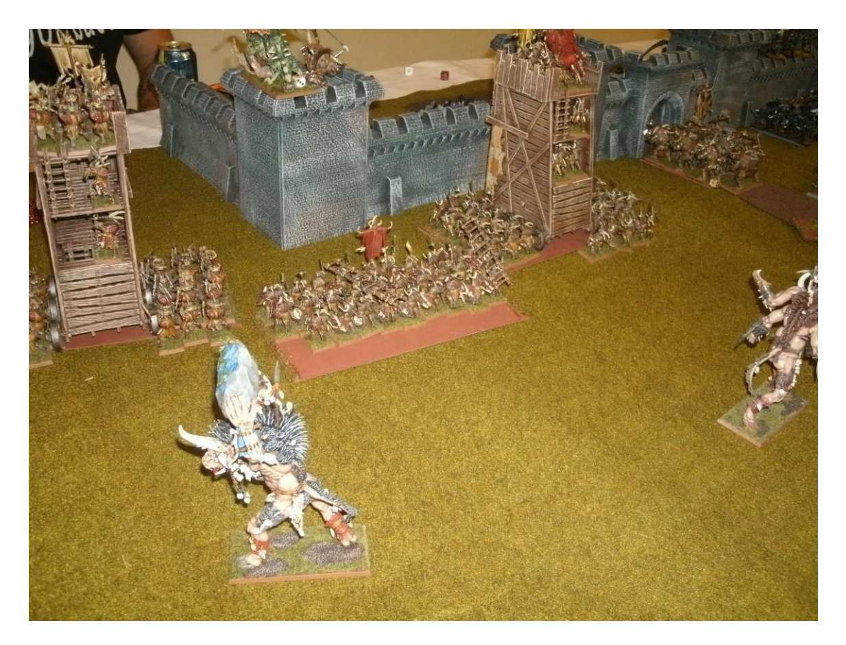
Of course, there was as usual a touch of Fantasy