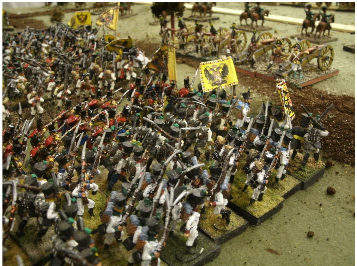
But what challenged even Moreno's Masterpiece was the Leipzig's 200<sup>th</sup> Anniversary game