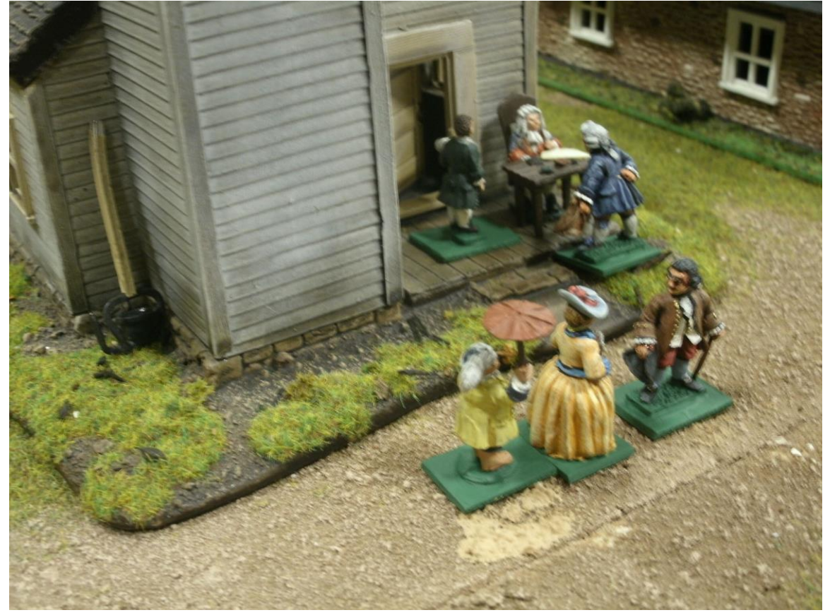
I don't know what those people were selling