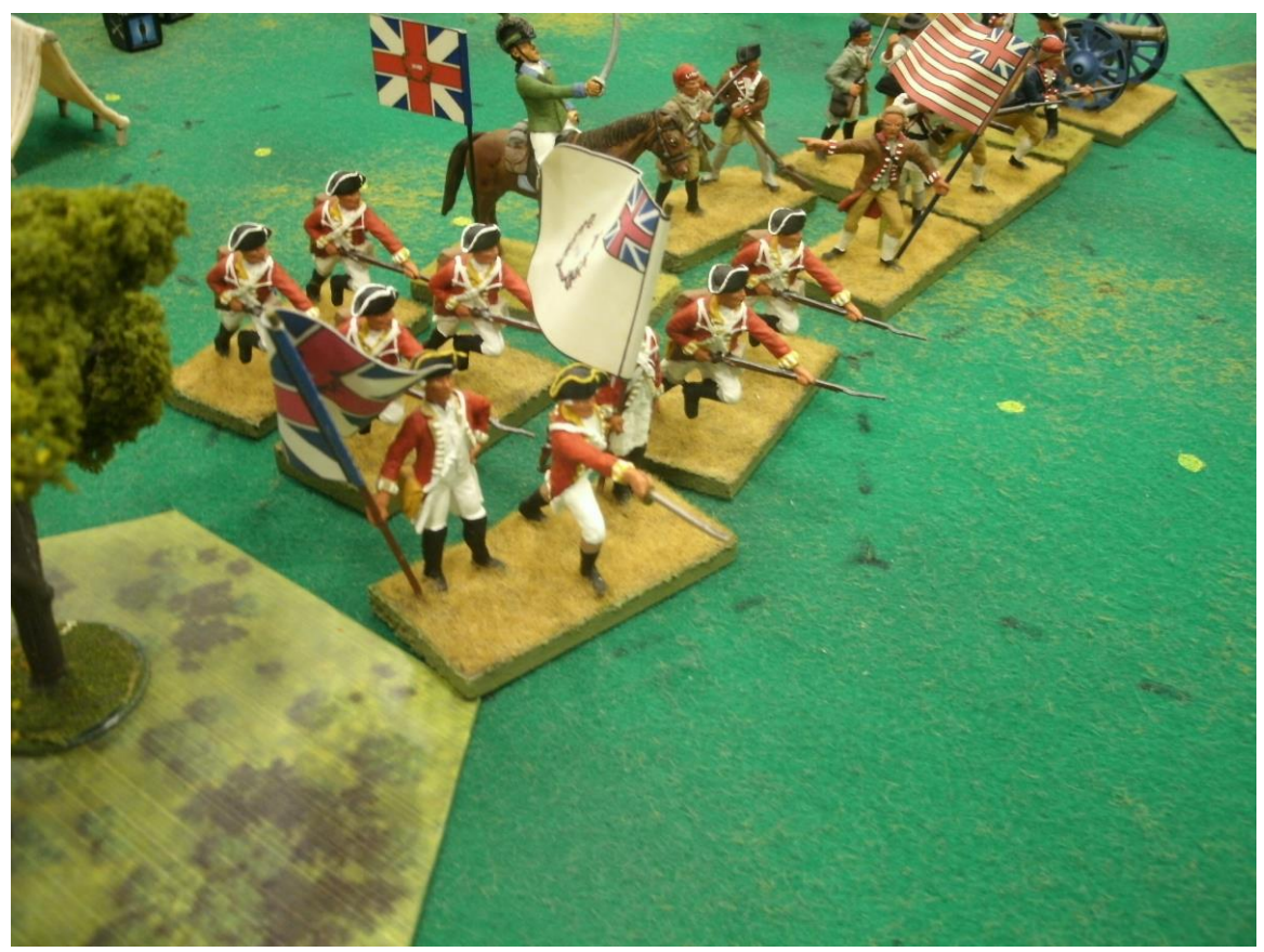
Brits up close and personal in 54mm