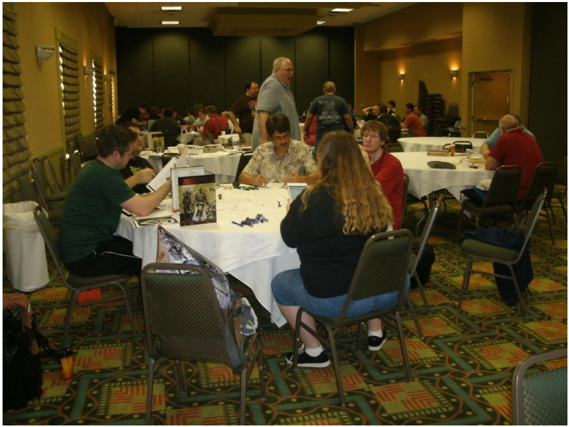
And It must Be admitted that the RPG crowd held out longer on Sunday