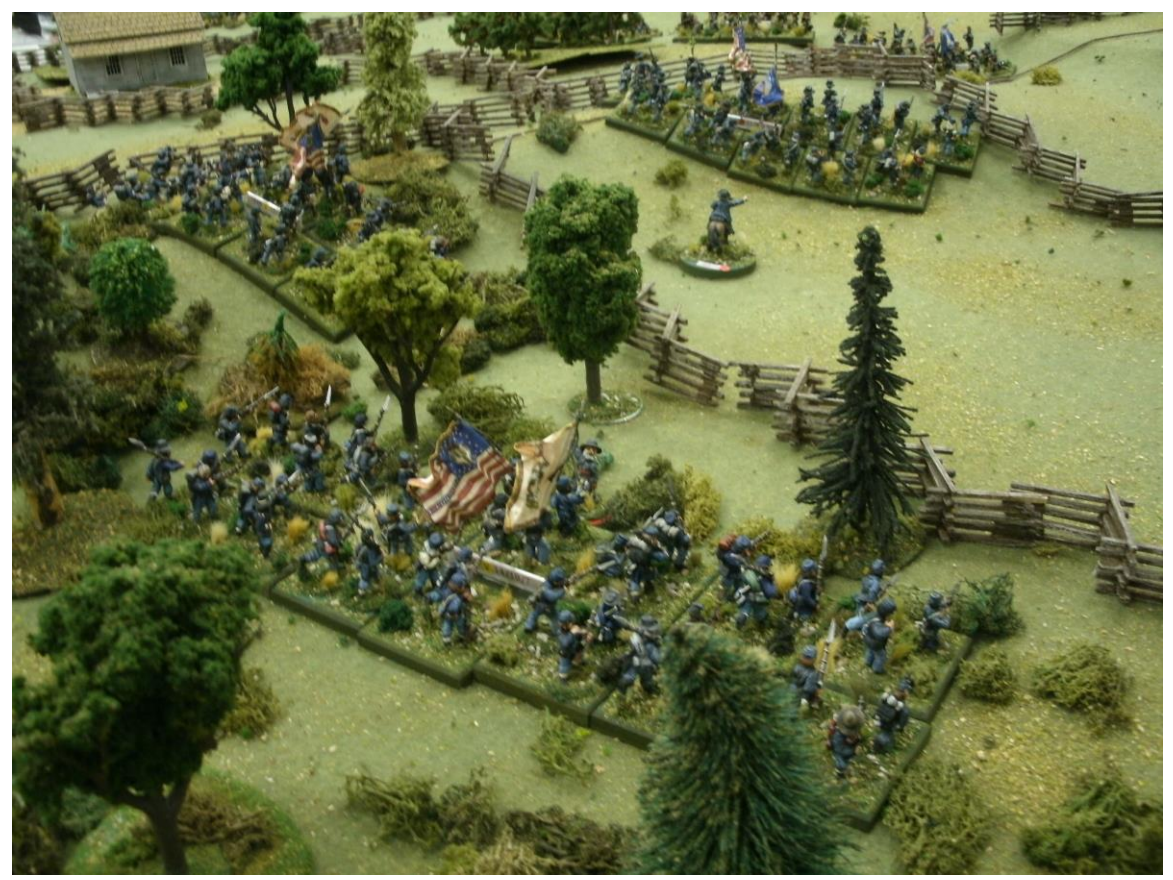
Followed by his usual spectacular 28mm ACW