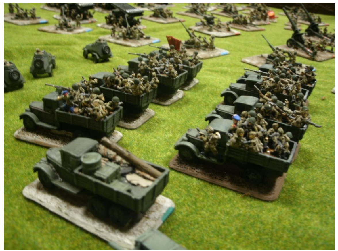
The Amelia Room hosts FOW and other WWII Demos - Here Soviet Motor Rifle Troops head hor the Meatgrinder