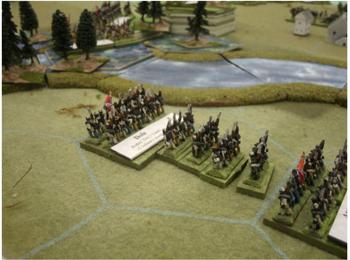
10mm Confederates close on Gettysburg