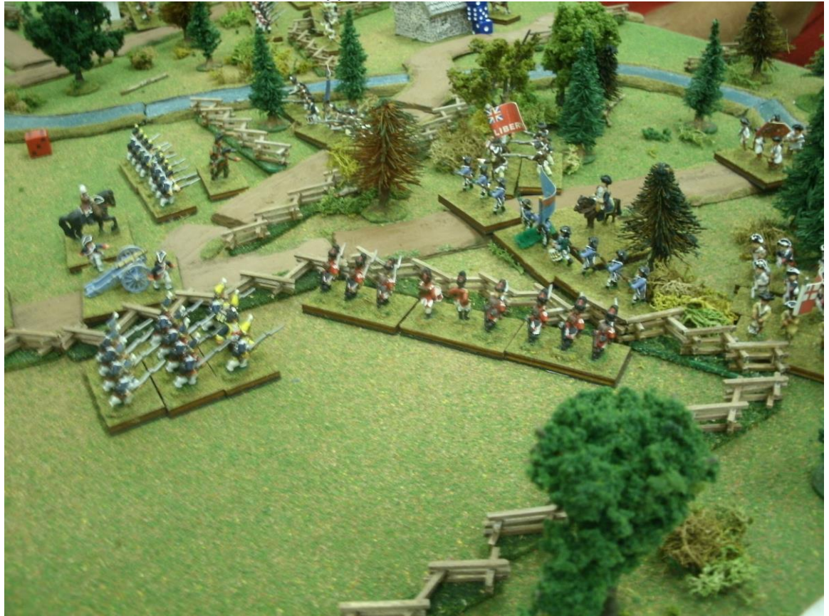
And what appears to be the American Revolution in DB-Whatever

Warriors approach Clontarf over the sand