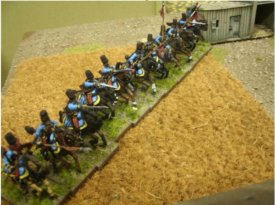
Lauzun's Legion at Glouchester-Half of whom are Polish Lancers