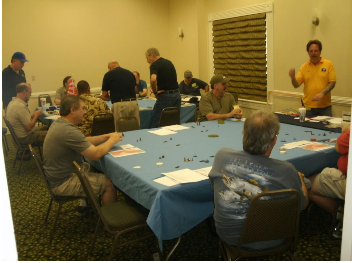
Seekrieg is off to an early start