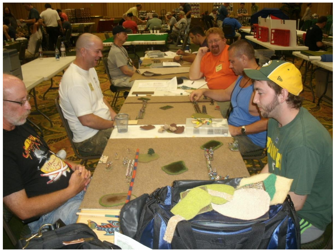
For most of the convention this table saw continuous and various DBA games