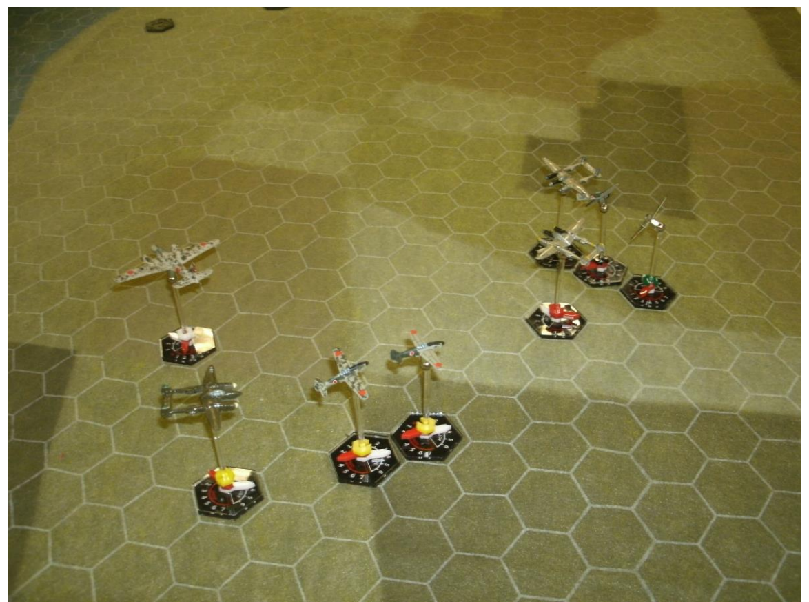
And a Pacific WWII Air Battle unusual in that it involves the Japanese Army