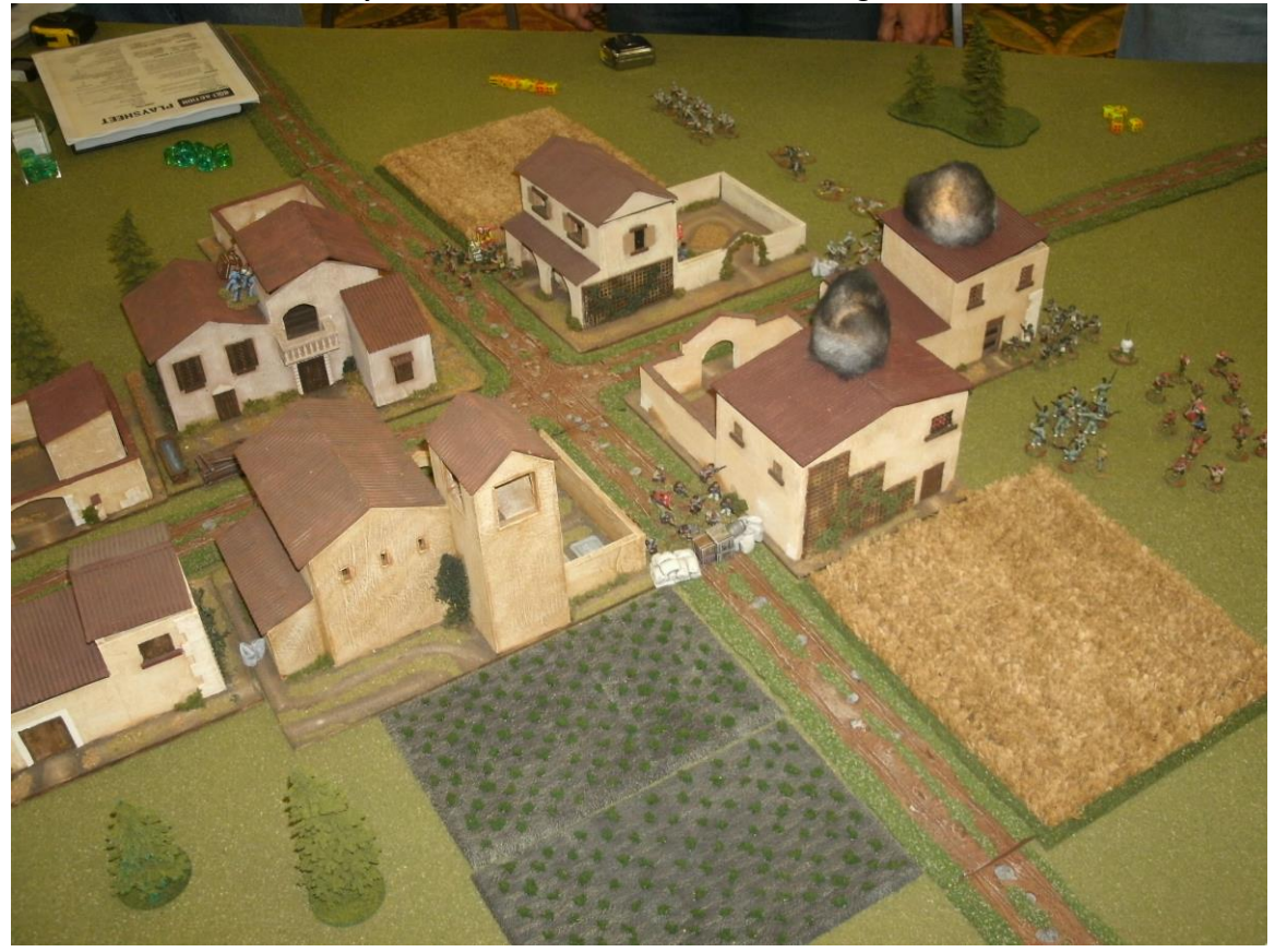
Nationalist hordes close in on town