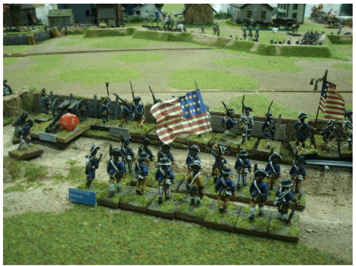
American Siege Lines