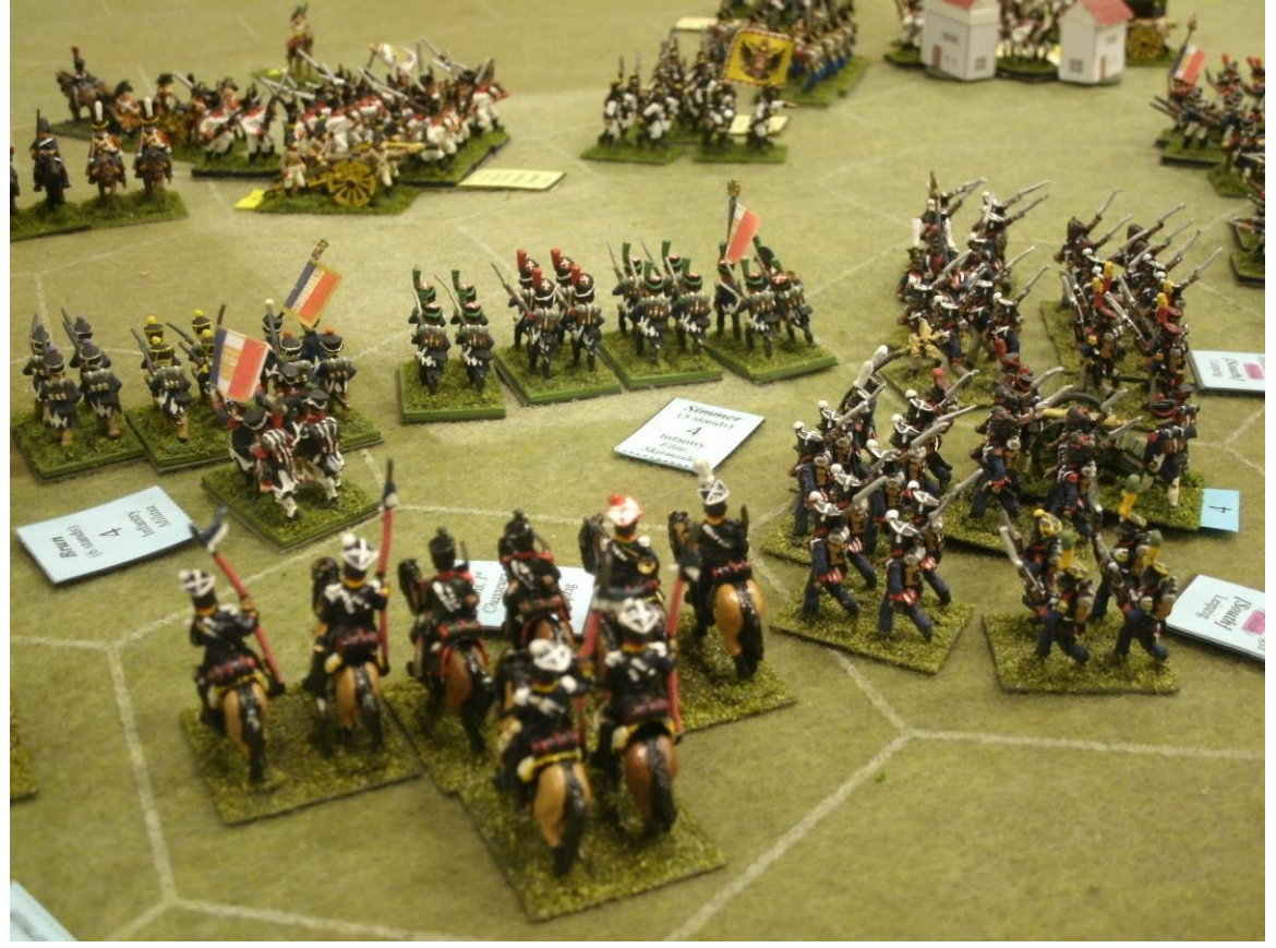
And there was a lot of what looked like Napoleonic Command and Colors