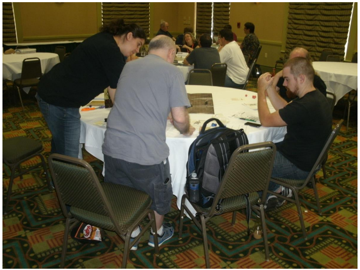
The RPG rooms got active